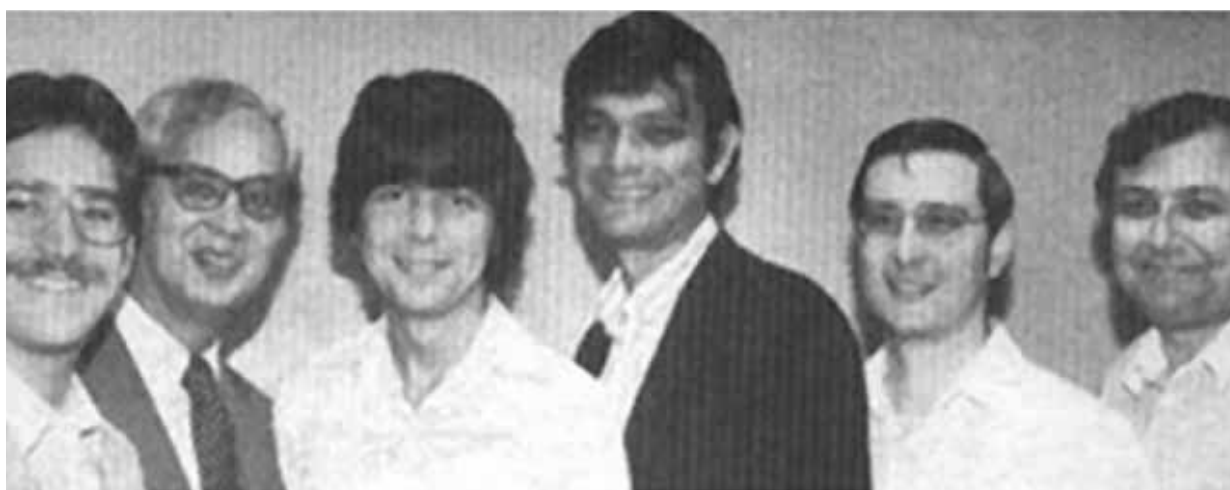
1981 Spingold winners. See page 1.

"We are proud of our city and the host hotels. We're glad so many players came to Boston, and we hope everyone had a good time."