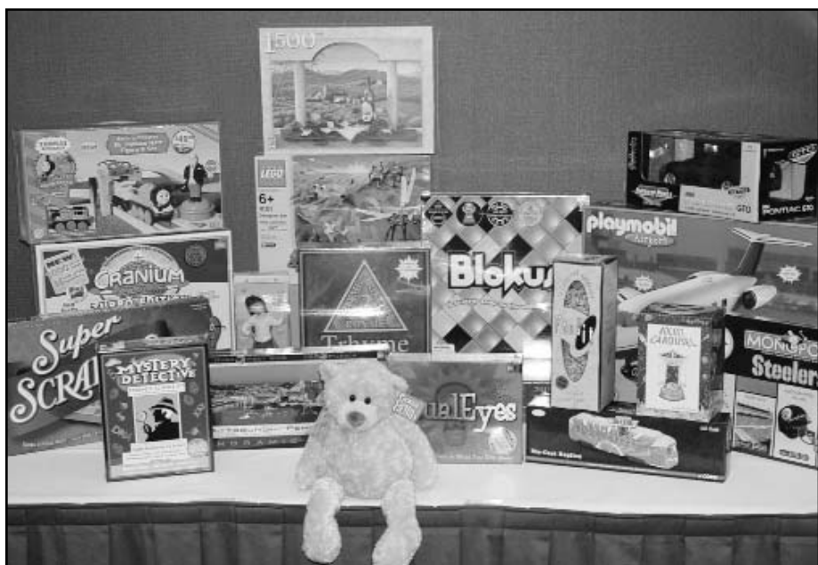
Pittsburgh's S.W. Randall Toyes & Giftes furnished these prizes for the winners of each bracket of the Tuesday-Wednesday Bracketed Knockouts. See page 5.

See page 8 for today's pairings and bracket sheet.