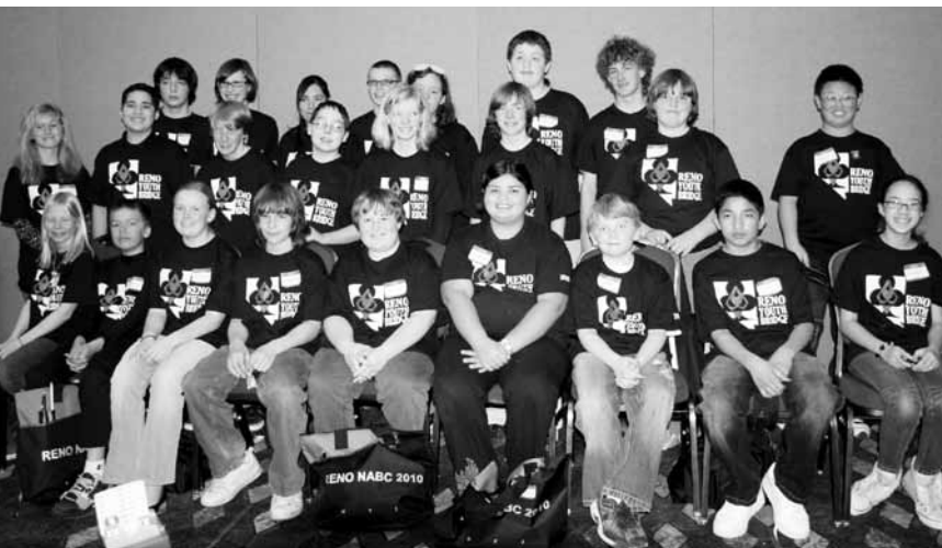
Six of the seven local middle schools sent players to the Junior Pairs game Saturday.