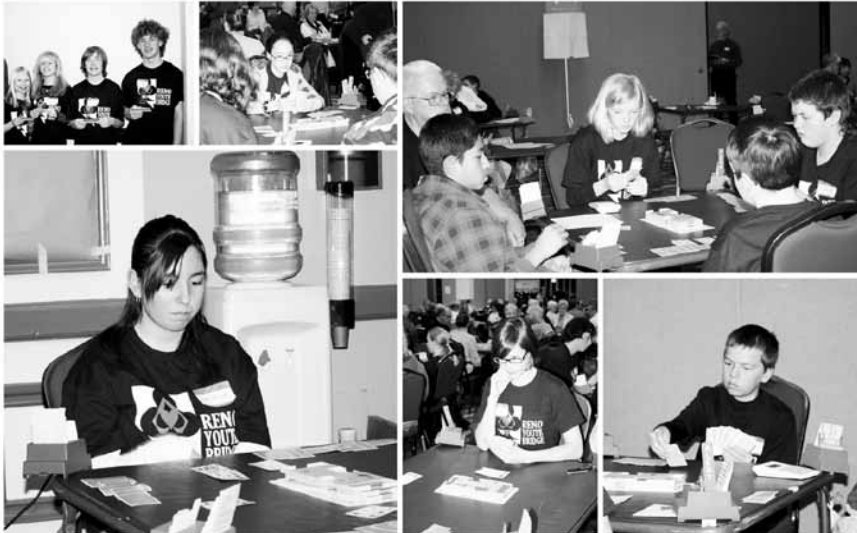
Players from area middle schools were excited to play in the Junior Pairs game Saturday.