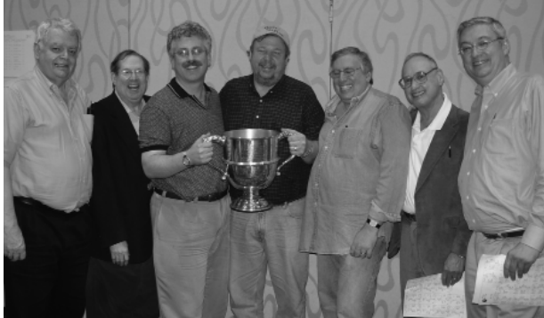
Winners in 2004 were Bob Hamman, Paul Soloway, Eric Rodwell, Jeff Meckstroth, Eric Kokish (coach), Richard Freeman and Nick Nickell.