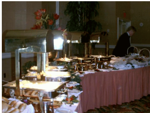
A buffet to die for.