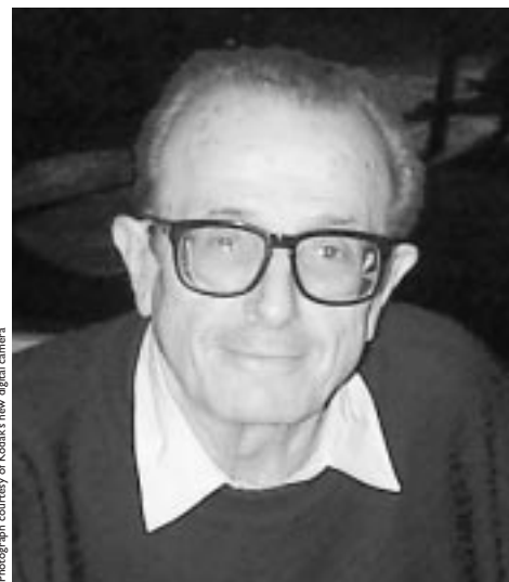
Photograph courtesy of Kodak's new digital camera