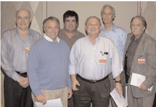
The Gold medal winners in the Seniors Bowl